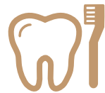
On-Site Dental Care